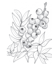
Lowbush Blueberry ( Vaccinium angustifolium )

For a brief time in the spring, the three vernal pools at Lilly Pond Community Forest become a hotspot of amphibian action. Listen for frog calls and watch for salamanders in April and early May and enjoy the views of these temporary pools before they dry out again in