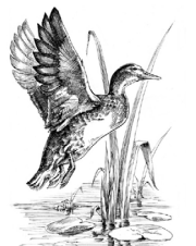
American Black Duck ( Anas rubripes )